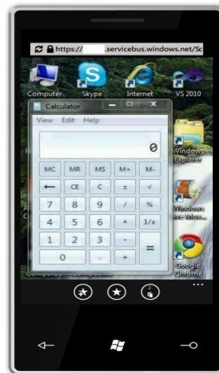
Fig 1.Screen access in Windows Phone

So far application was tested with Google chrome, Internet Explorer (IE), android, Windows Phone 8, iPhone, Firefox.